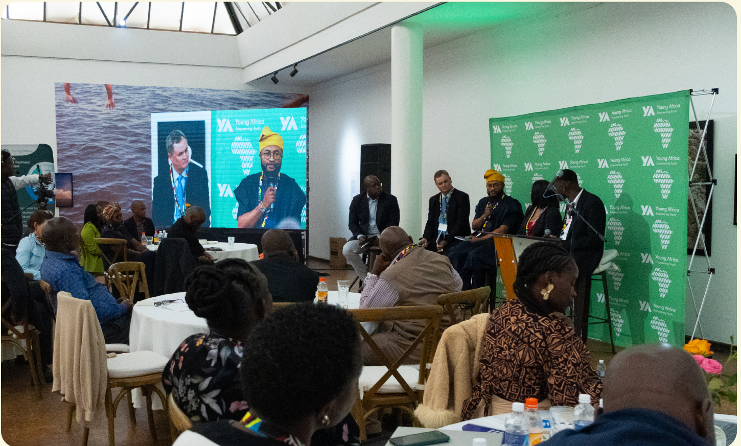
TVET Conference in October, attracting 117 participants.