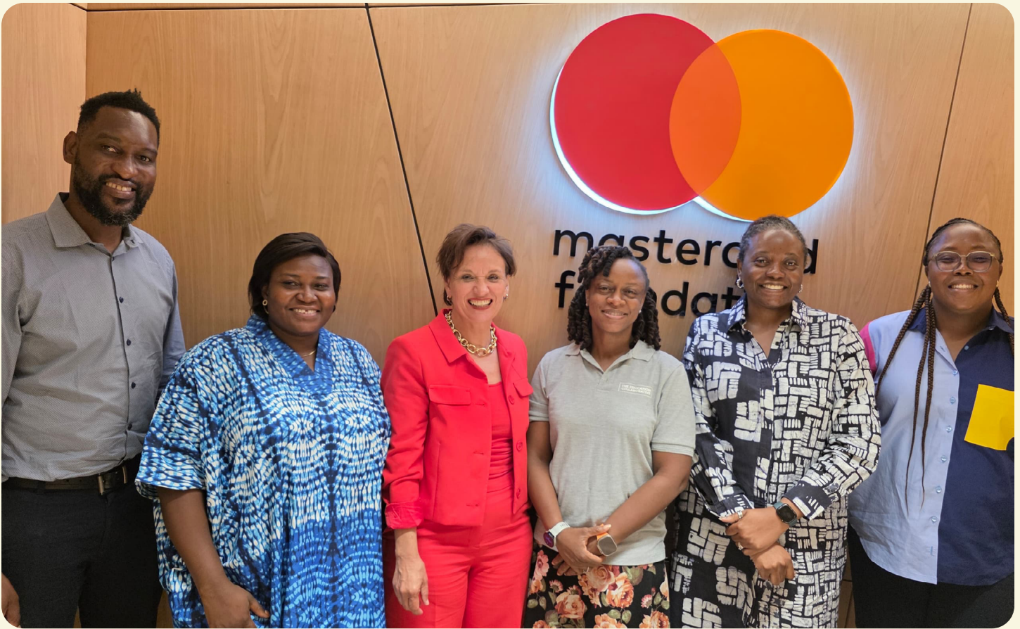
Youth Employability Booster Project launch in Nigeria.